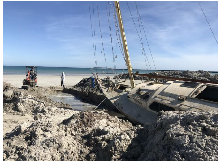
Digging a trench to relaunch the boat

boat back in the water. The SA Fire boat then towed it to a public ramp at North Haven, only to have it sink again during strong winds during the night. It was then scrapped. Sad ending for a historic wooden boat built in 1950.