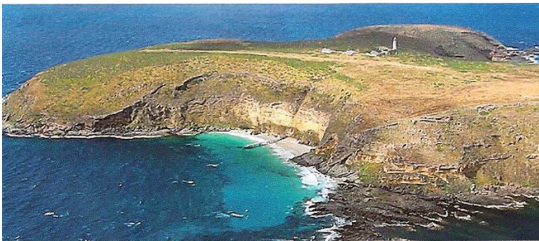
Althorpe Island – looking south