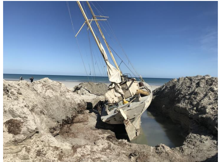
Several attempts were made by the owner