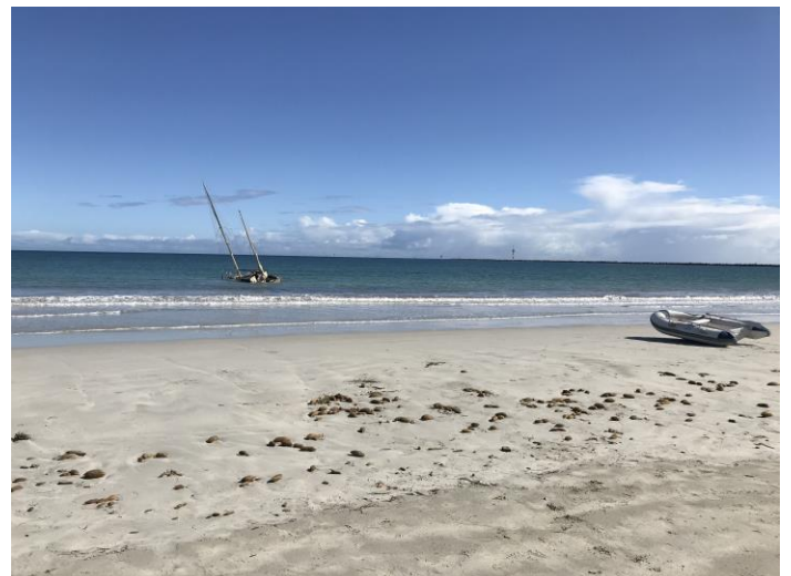
Finally refloated, it was then towed to North Haven