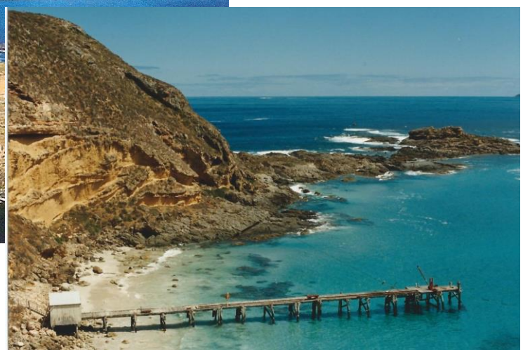
Eastern Bay Jetty – Flying Fox (zip line) and crane on end of jetty

I ferried First Class , an 11-metre Beneteau yacht, from Adelaide to Port Lincoln. After we anchored in Athorpe's eastern bay, the crew wanted to go ashore. We had a small rubber dinghy with no engine, powered by oars only. I stayed on board while the shore party successfully rowed to the sandy beach. They then walked up to the lighthouse, via a rough path hewn in the side of the limestone cliffs; and some hours later they returned to the beach. In the meantime, a particularly vicious south-easterly wind had sprung up. The bullets of wind came swirling round the rugged headland in strong gusts. I thought to myself that it was going to be quite difficult rowing out to First Class in these conditions. I was not wrong, as the little dinghy got halfway between the shore and the yacht and was caught by the wind.